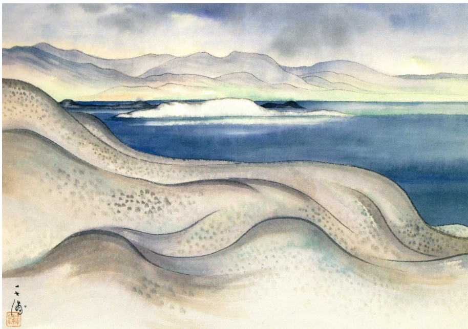
Along Mono Lake, 1927, sumi and watercolor on paper

Student Outcome : Students will practice close looking and writing skills through crafting poems inspired by Obata's natural landscapes.