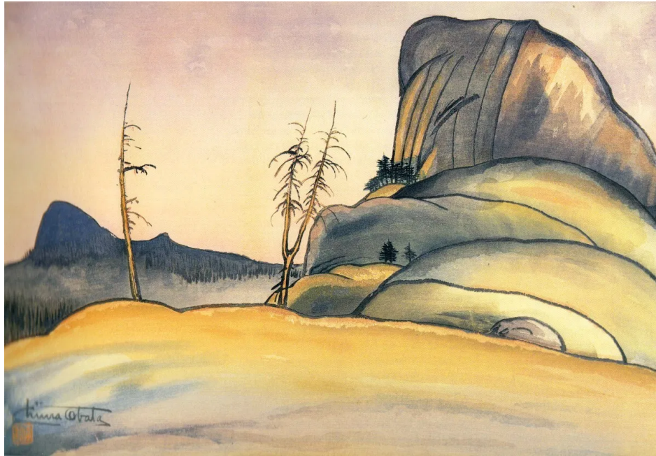
Death's Grave Pass, 1930, color woodblock print

Student Outcome : Students will study Obata's signature landscape paintings and create individual works of art in his style, using texture from nature. Students will further compare and contrast patterns, color, and texture between their work and Obata's.