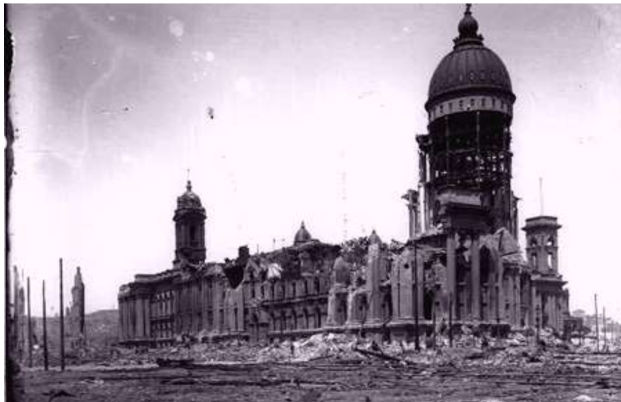
San Francisco City Hall after the 1906 Earthquake. (from Steinbrugge Collection of the UC Berkeley Earthquake Engineering Research Center)

https://www.pbs.org/nationalparks/media_detail/544/