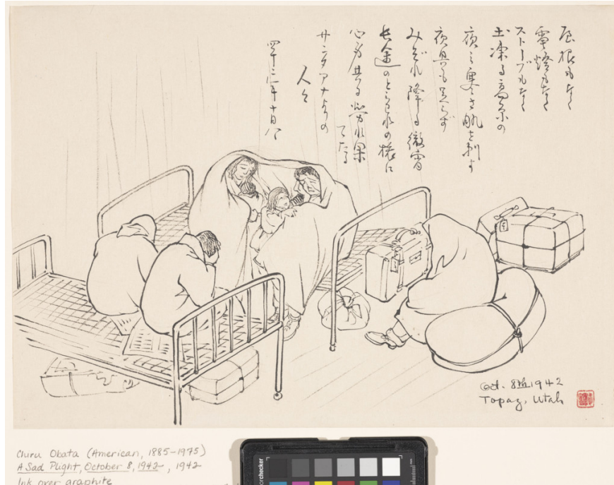
Chiura Obata (American, b. Japan, 1885–1975), A Sad Plight, October 8, 1942, ink over graphite on paper, 11 x 15 3/4 in., Fine Arts Museums of San Francisco, Museum purchase, gift of the Graphic Arts Council, 2001.28.3