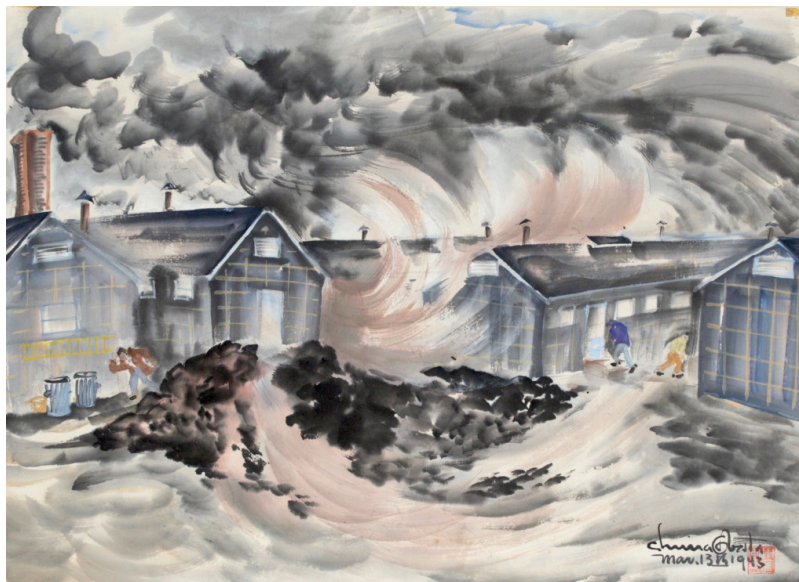
Chiura Obata (American, b. Japan, 1885–1975), Dust Storm, Topaz, March 13, 1943, watercolor on paper, 14 1/4 x 19 1/4 in., private collection https://www.theutahreview.com/umfas-chiura-obata-american-modern-exhibition-artistic-meta-narrative-immigrants-faith-american-experiment/