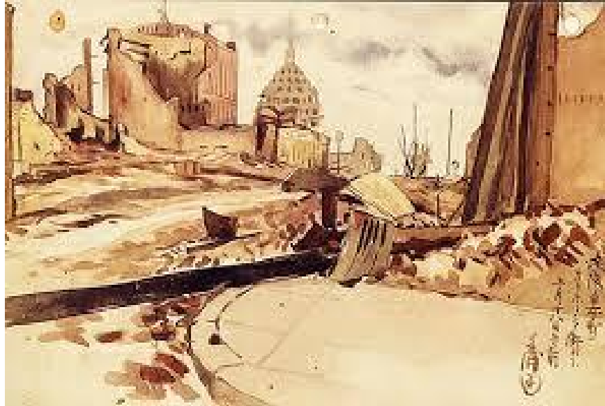
Chiura Obata, View of Burnt Out Japantown from California Street, 1906

https://www.pbs.org/nationalparks/media_detail/544/