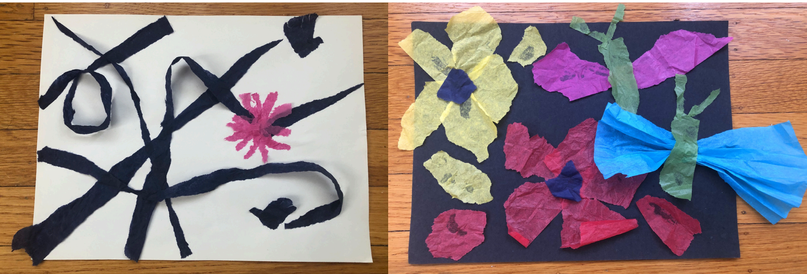
Chigiri-e inspired by teamLab's Crows are Chased and the Chasing Crows are Destined to be Chased as well, Transcending Space (left) and Flutter of Butterflies Beyond Borders, Ephemeral Life (right).