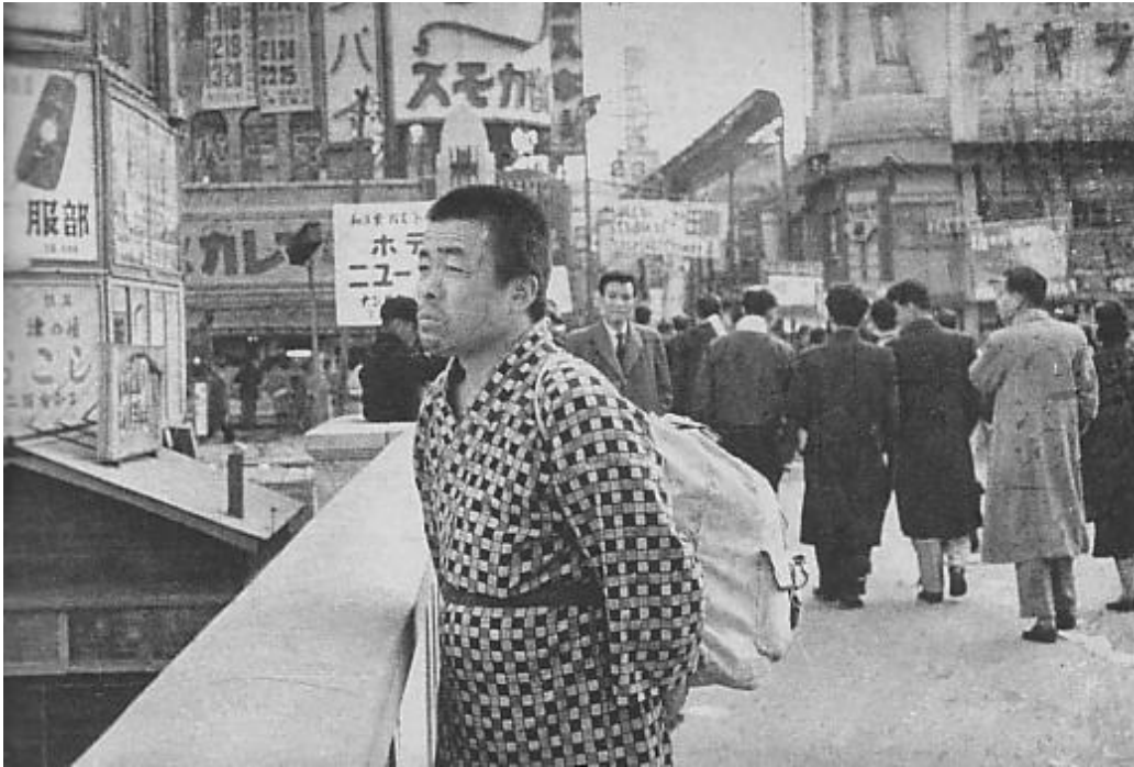
Kiyoshi Yamashita on Ebisubashi Bridge, Wikipedia.