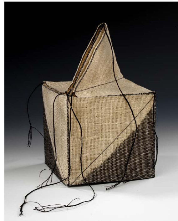
Ikat Box , 1996, by Kay Sekimachi (American, b. 1926). Linen and acrylic paint. Smithsonian American Art Museum, Museum purchase through the Renwick Acquisitions Fund, 2003.25.