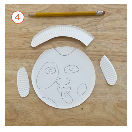
On the middle of the plate, sketch your animal's eyes, nose, mouth, and any other details of the face.