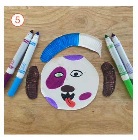
Color in the face, ears, and tail.