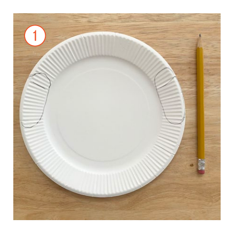
On the edge of the paper plate, draw the ears and tail of the animal with a pencil.