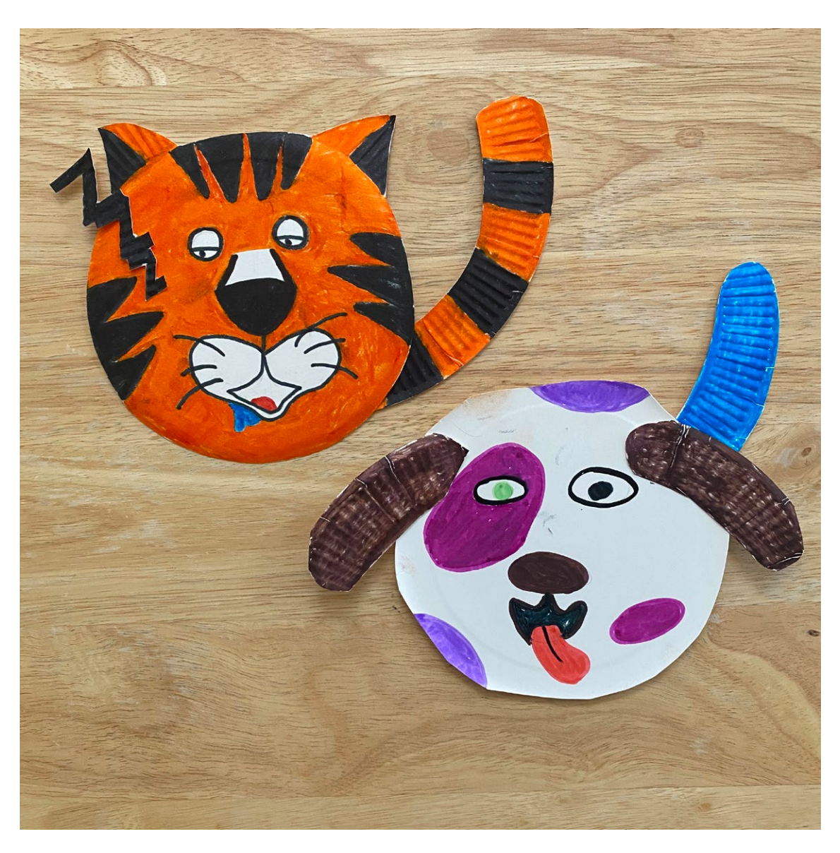
Now you can retell the story with your paper plate animal!