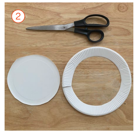
Cut out the plate's border with your ears and tail.