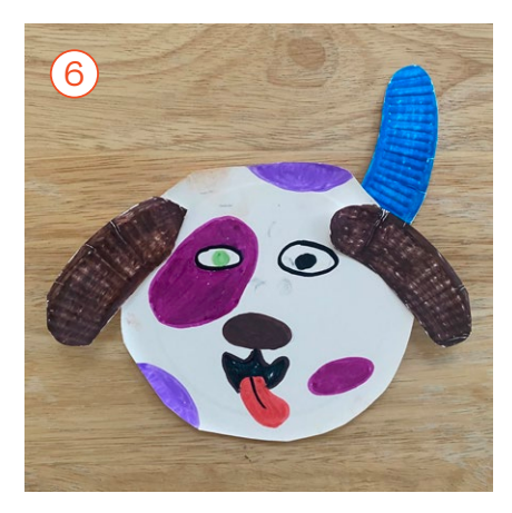
Tape the ears and tail to the face of your animal.