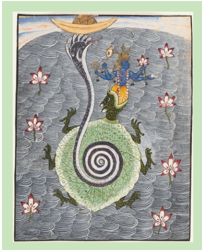
Tortoise ( Kurma ) avatar of Vishnu, approx. 1690. India; Rajasthan or Central India. Opaque watercolor and gold on paper. Asian Art Museum, Museum purchase, Mortimer-Harvey Fund , 2016.127.