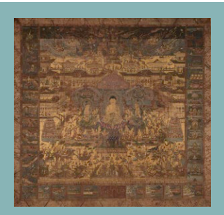
Taima mandala, 1300–1400. Japan, Kamakura period (1185–1333), Nanbokucho period (1333–1392), or Muromachi period (1392–1573). Hanging scroll; ink, colors, and gold on silk. Asian Art Museum, The Avery Brundage Collection, B61D11+.