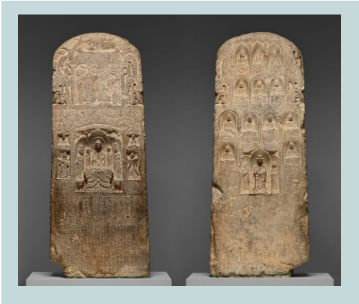
Buddhist stele. China, Western Wei dynasty (535–550). Limestone. Asian Art Museum, The Avery Brundage Collection , B62S2+.