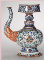
Ritual pouring vessel. China; Jingdezhen, Jiangxi province, Qing dynasty (1644–1911), Reign of the Qianlong emperor (1736–1795). Porcelain with underglaze blue and overglaze multicolor enamel decoration. Asian Art Museum, The Avery Brundage Collection, B60P2298.