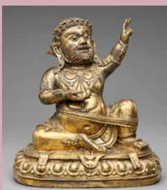
The Buddhist great adept Virupa, approx. 1400–1450. China, Ming dynasty (1368–1644). Gilded bronze. Asian Art Museum, The Avery Brundage Collection, B62B20.