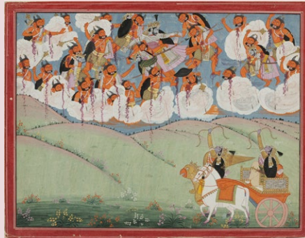
Krishna and Pradyumna rescue Arjuna, from a Harivamsha manuscript, approx. 1820. India; Kangra or Guler, Punjab Hills. Opaque watercolors and gold on paper. Asian Art Museum, Acquisition made possible by the George Hopper Fitch Bequest, 2013.1.