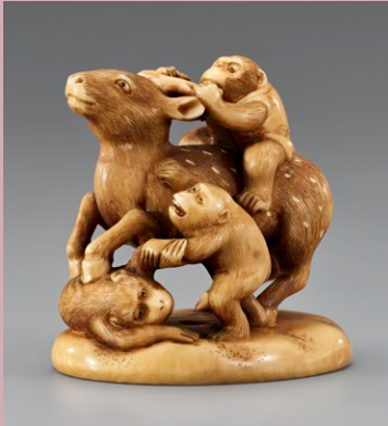
Three monkeys playing with deer, 1800–1900. by Ikkosai (Japanese). Ivory with detail staining; pupils inlaid with dark horn. Asian Art Museum, The Avery Brundage Collection, B70Y1250.

Click on the image to see the artwork in detail on Google Arts and Culture.