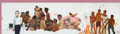
River , 2005–2006, by Liu Xiaodong (Chinese, born 1963). Acrylic on paper. Asian Art Museum, Gift of Bo Dan, 2006.18.