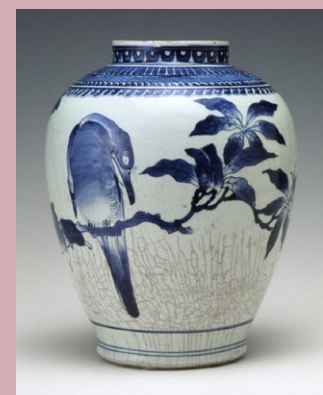
Jar with bird design, 1660–1670s. Japan; Arita, Saga prefecture, Edo period (1615–1868). Porcelain with underglaze blue decoration. Asian Art Museum, The Avery Brundage Collection, B64P37.