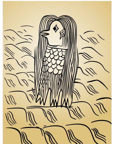
A drawing of Amabie based on a Japanese woodblock print from the late Edo period.