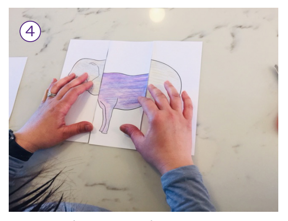
Now you have "puzzle pieces" of different heads, bodies, and tails that you can mix and match to produce new creatures. Optional: Glue the puzzle pieces onto pieces of cardboard, so they are sturdy and reusable.

Take a picture of each new combination you create. What name might you give your new mythical creature? What powers might it have?