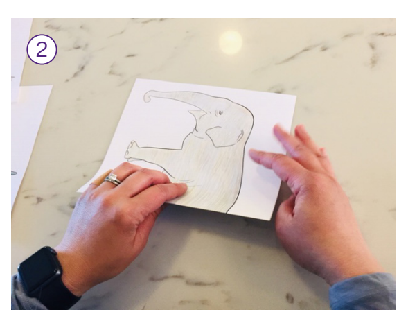
Fold each animal template in thirds (like you would a letter).