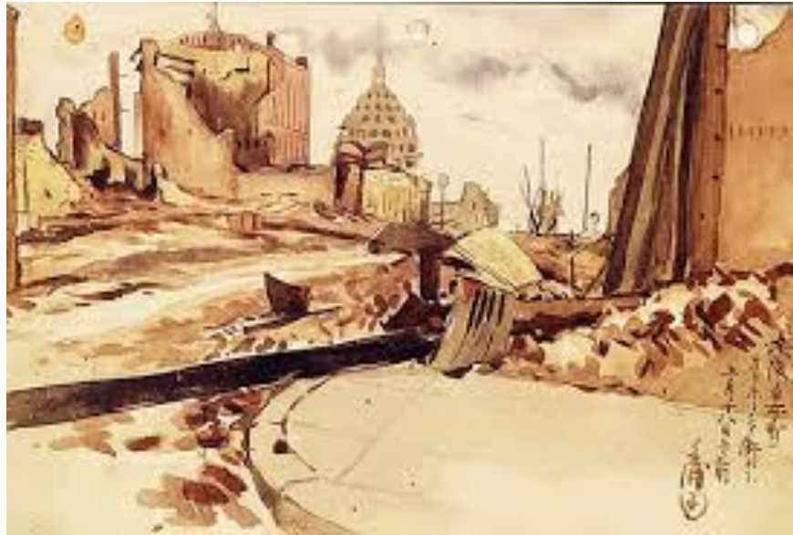
Chiura Obata, View of Burnt Out Japantown from California Street, 1906

https://www.pbs.org/nationalparks/media_detail/544/