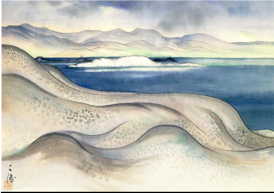
Along Mono Lake, 1927, sumi and watercolor on paper

Outcome : Students will practice close looking and writing skills through crafting poems inspired by Obata’s natural landscapes.