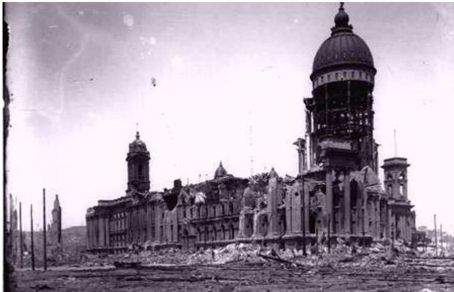
San Francisco City Hall after the 1906 Earthquake. (from Steinbrugge Collection of the UC Berkeley Earthquake Engineering Research Center)

https://www.pbs.org/nationalparks/media_detail/544/