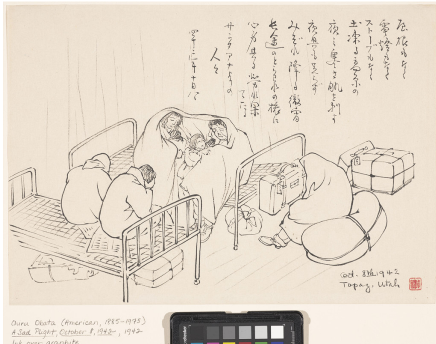
Chiura Obata (American, b. Japan, 1885–1975), A Sad Plight, October 8, 1942, ink over graphite on paper, 11 x 15 3/4 in., Fine Arts Museums of San Francisco, Museum purchase, gift of the Graphic Arts Council, 2001.28.3