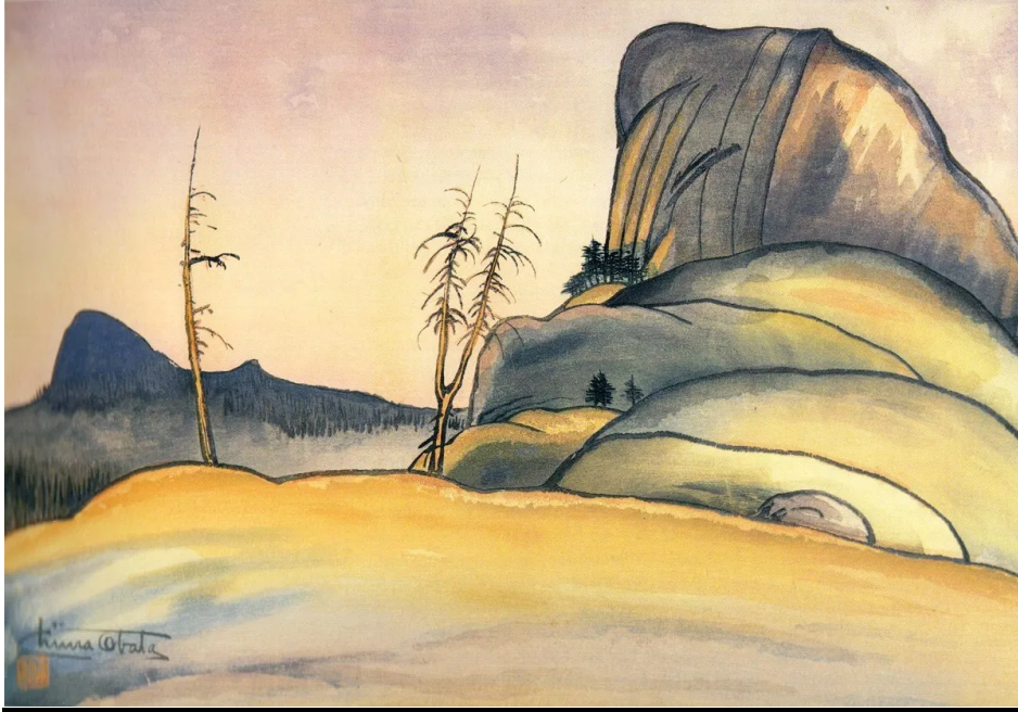
Death's Grave Pass, 1930, color woodblock print

Student Outcome : Students will study Obata's signature landscape paintings and create individual works of art in his style, using texture from nature. Students will further compare and contrast patterns, color, and texture between their work and Obata's.