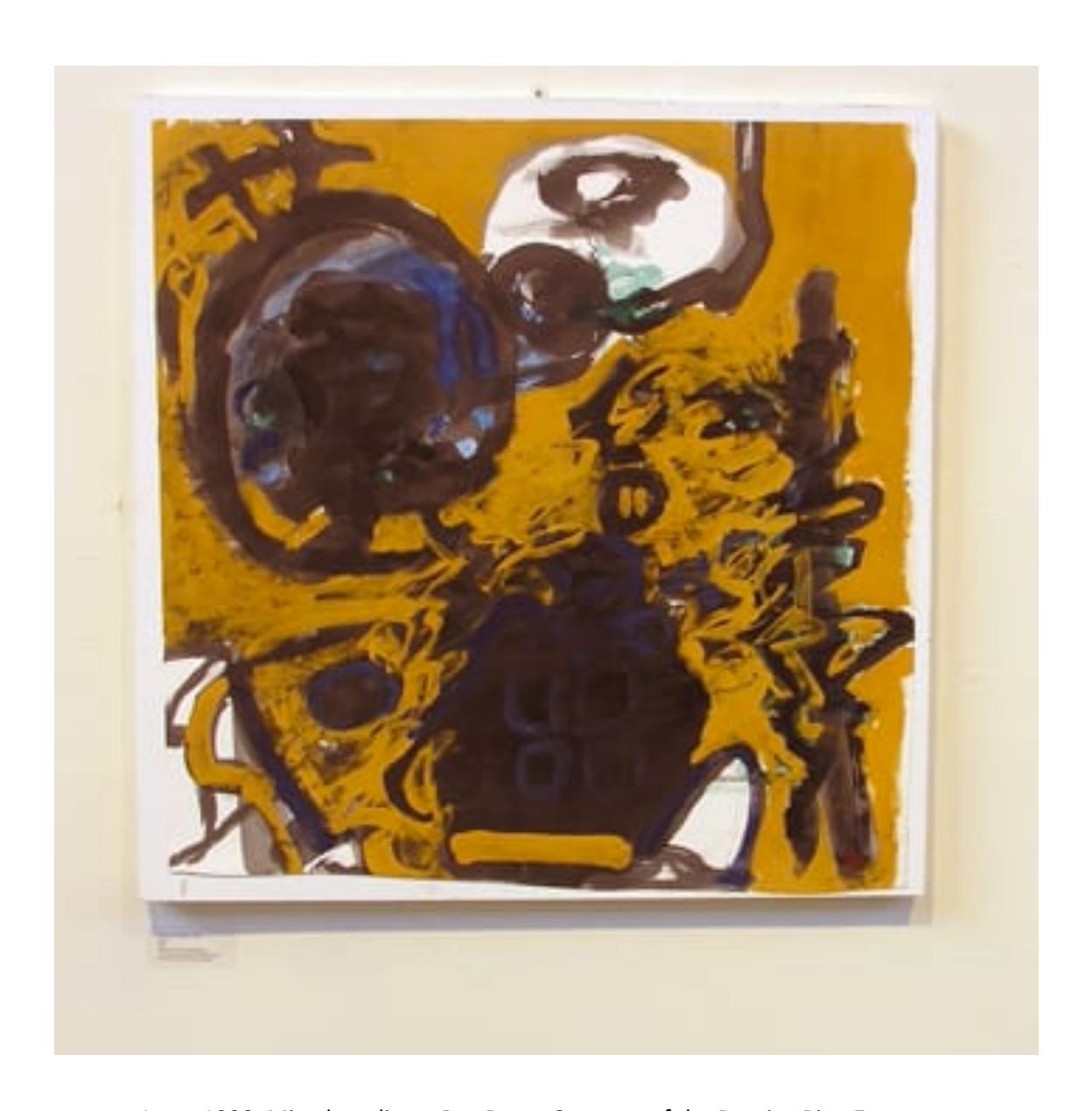
Lotus 1990, Mixed media on Rag Paper Courtesy of the Bernice Bing Estate Curator: Queer Cultural Center