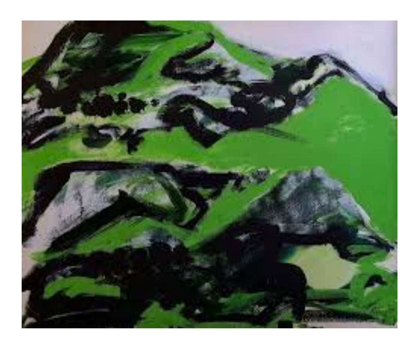
Bernice Bing, Anderson Valley, © 1994 <a href="https://svma.org/exhibition/bingo/?fbclid=lwAR3EX5vvMXcRUbkBI8IUpBfygRtyfBocsKx8pG0R2AM6rvhG6Qgk5VpQDQ">https://svma.org/exhibition/bingo/?fbclid=lwAR3EX5vvMXcRUbkBI8IUpBfygRtyfBocsKx8pG0R2AM6rvhG6Qgk5VpQDQ</a>