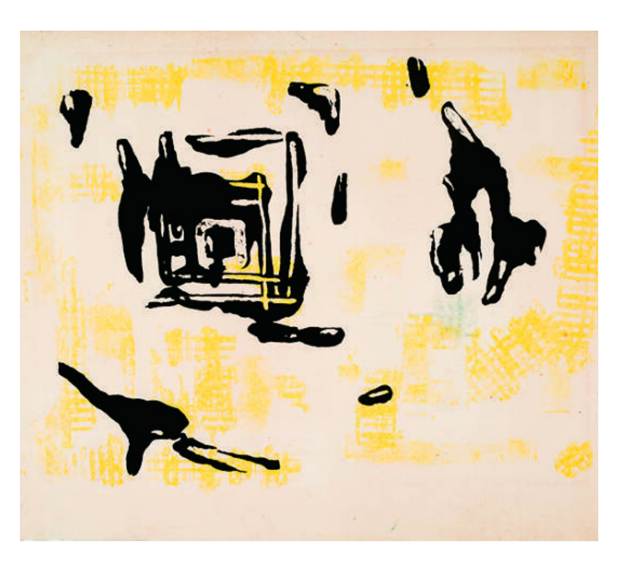
Untitled', 1952, Saburo Hasegawa.