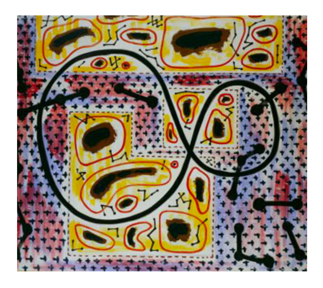
Hasegawa, Locus of a Butterfly, 1937