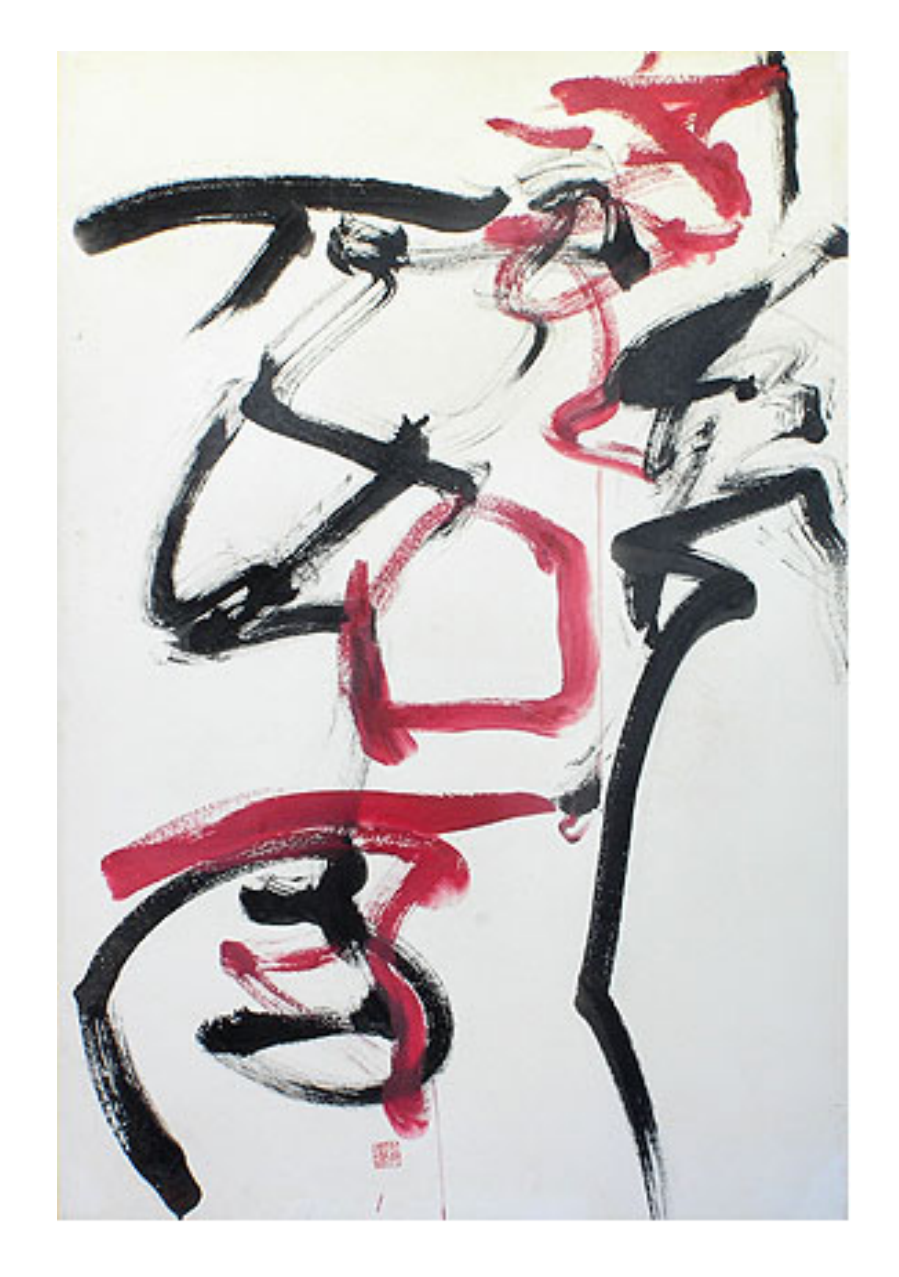
Abstract Calligraphy Mixed media, 35" x 24", 1987 Collection of Bernice Bing Estate