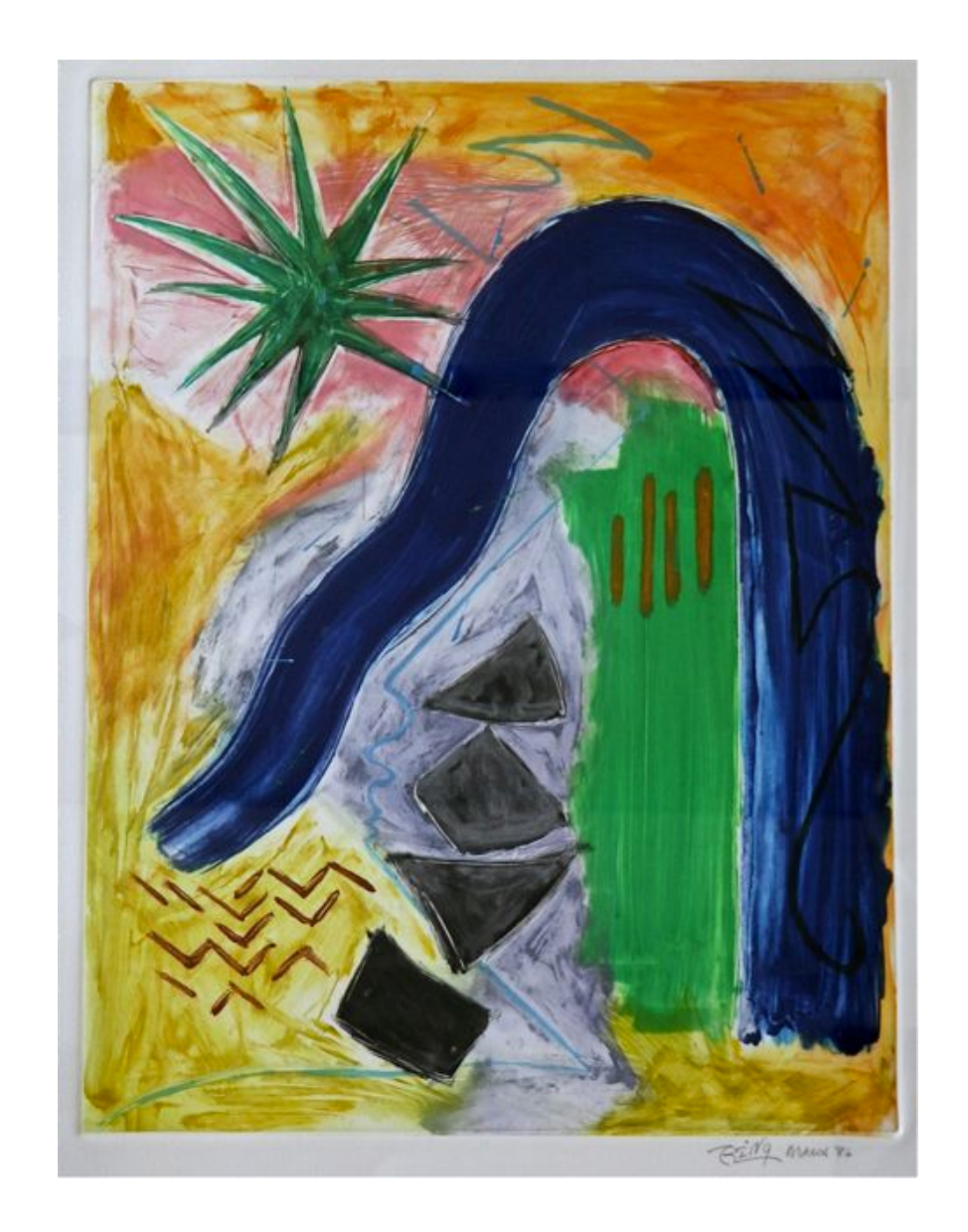
March '86 by Bernice Bing, 1986, Monoprint, 24×17-1/2