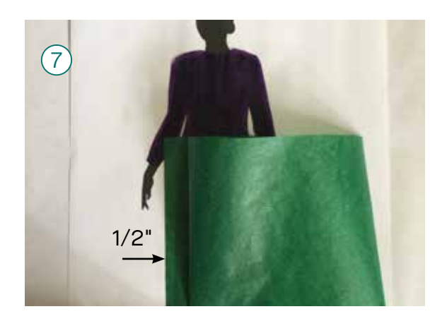
Fold the portion of the paper now on the left back to the right to make your first pleat, make that pleat about 1/2 inch.