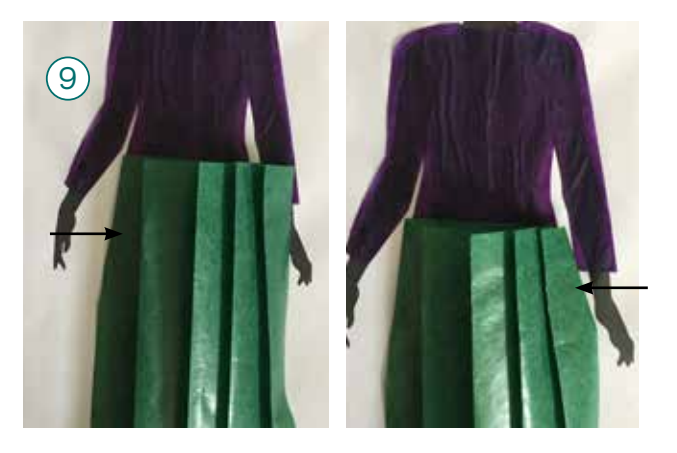
Fold the top corners of the skirt in, so the skirt aligns to the hips of the model.