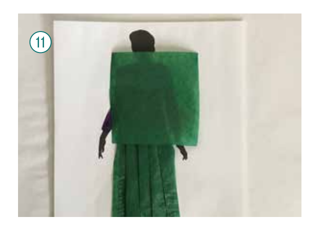
Cut out a 4 inch by 4 inch rectangle for the top part of the sari.