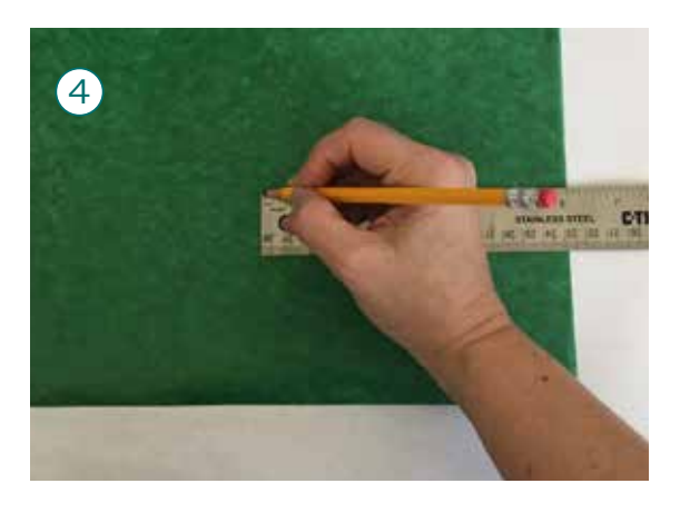
Measure and cut out a 10 inch by 6 inch rectangle of the color tissue paper you want to use for the lower part of the sari.