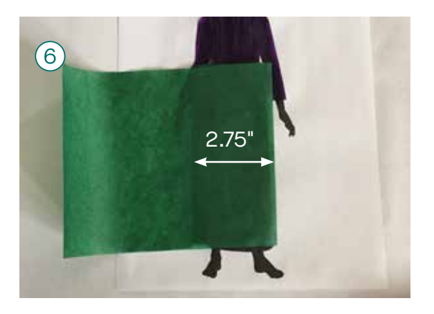
Fold in the paper from the right to make your first fold which measures about 2.75 inches.