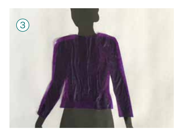
Cut out the blouse and glue it on the model.