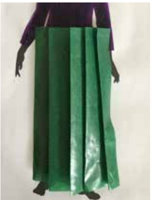
Continue to fold the paper back and forth to make 3 more pleats for your skirt, each pleat measuring about 1/2 inch.