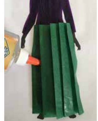
Glue the skirt to the model and then glue the pleats in place.