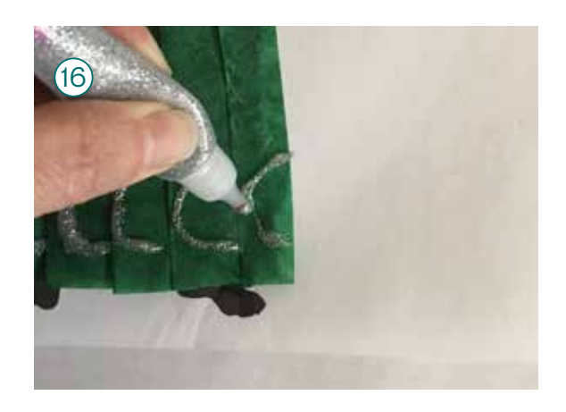
You can use a different color tissue paper to make a border (See the sample on the first page). Use the glitter pens or glitter glue to add zari decoration to your sari.