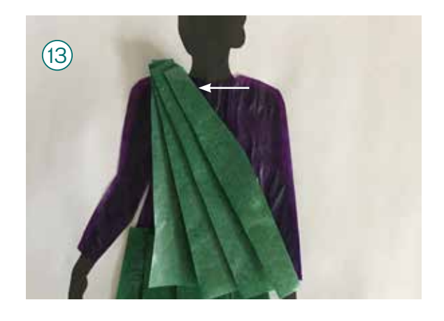
Fold back the corners like you did on the skirt at the top of the sari.