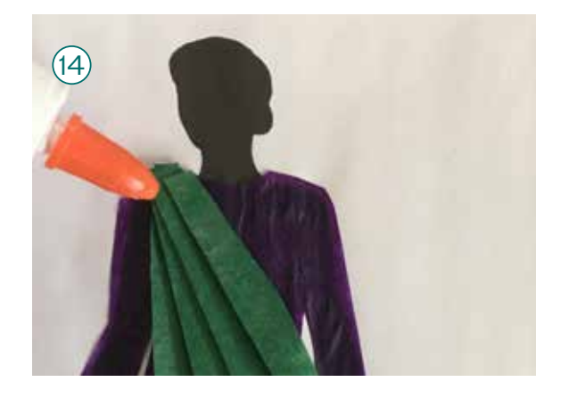
Glue down the top of the sari, including inside the pleats.