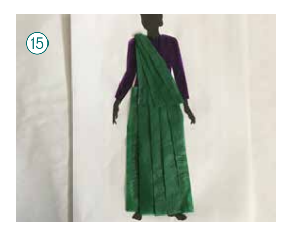
Now you are ready to decorate your sari.