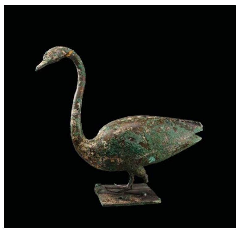
Asian Art Museum Education Department