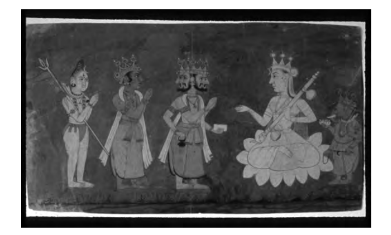
Adoration of Saraswati Gouache on paper Chamba, ca. 1800 Fine Arts Museum of San Francisco Achenbach Foundation for Graphic Arts Gift of Paul Wonner

What do you notice about these figures? How are they different from one another? How are they different from ordinary human beings? What kind of beings might they be? What are they doing? Which one is most important? How do you know?