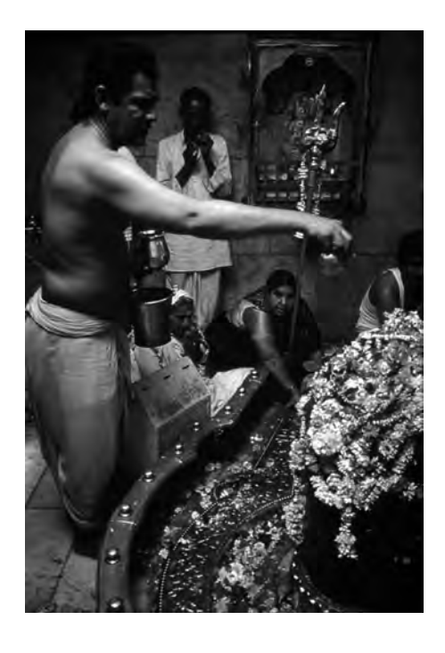
Worship of the linga Mahakala Temple, Ujjain, M.P.

Worship in India is usually personal and individual except for special festival days. The gods in the temple are treated in a similar fashion by the priests as they are in home altars by family members. They are bathed, decorated, and fed offerings two to four times a day. Also, a single devotee or several people may engage a priest for services in a temple for prayers on important occasions.