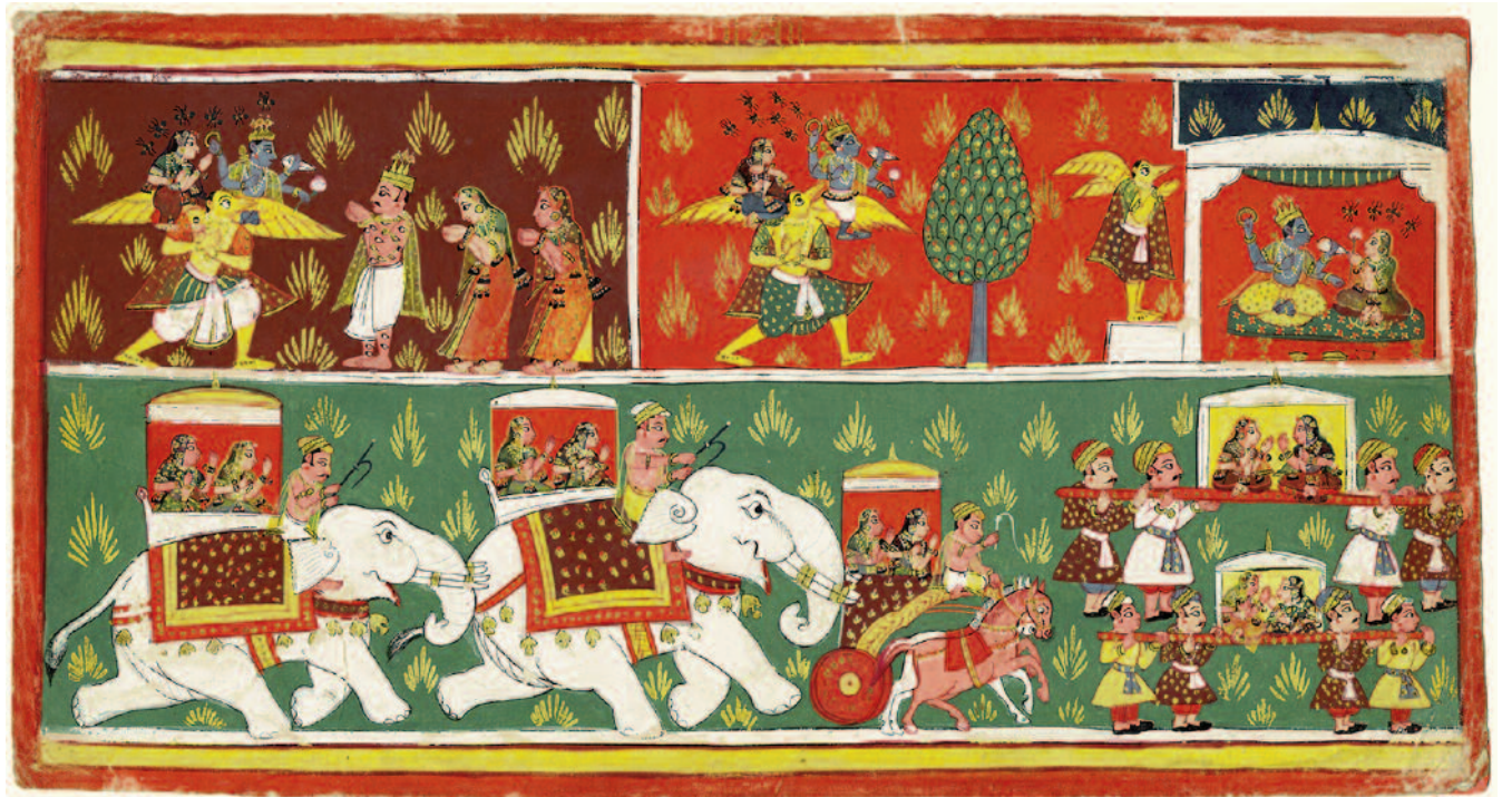
Stealing of the wish-fulfilling tree, 1700–1800. India; former kingdom of Malwa, Madhya Pradesh state. Ink and colors on paper. Gift of George Hopper Fitch, R1998.2.4